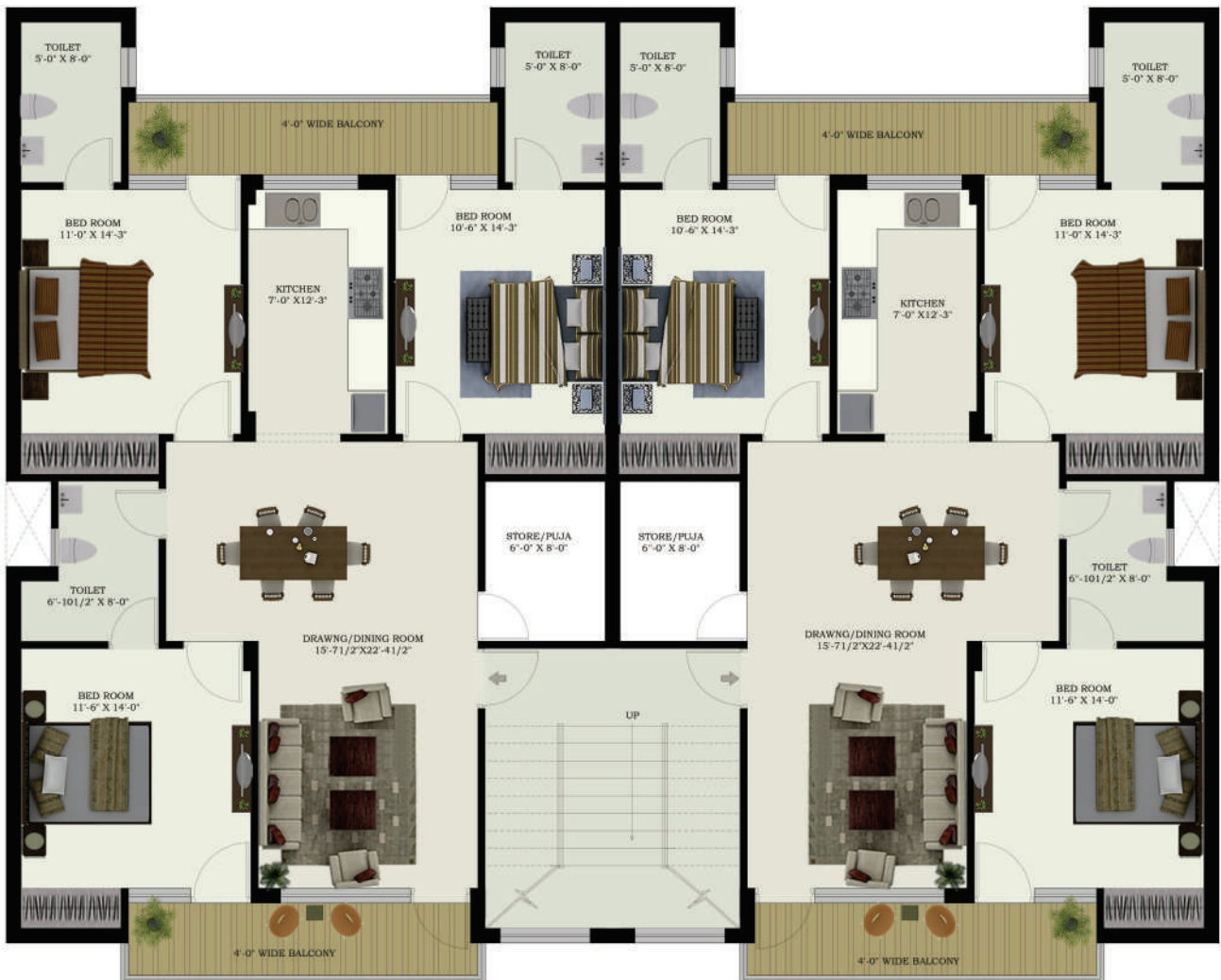
Typical Floor Plan 3 BHK - Super Area - 1460 sq.ft.