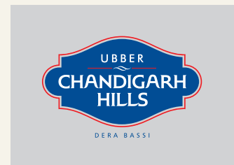
CHANDIGARH HILLS (Upcoming)