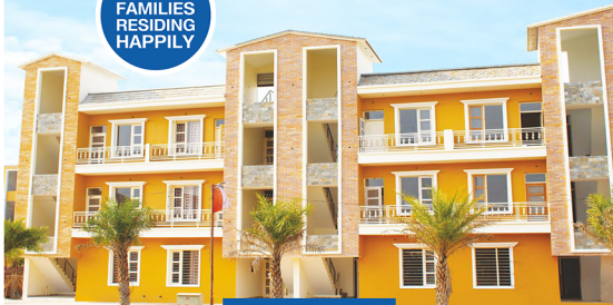
All Actual Photographs